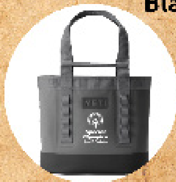
$2,000 YETI Tote