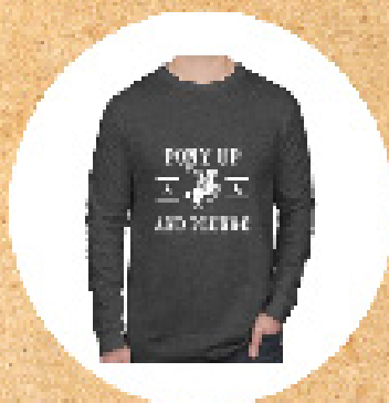
$100 Long-sleeve T-shirt