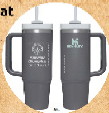
$1,000 Stanley Cup