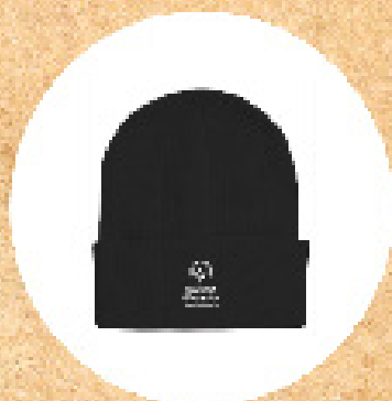
$250 Stocking Hat