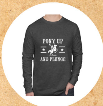
$100 Long-sleeve T-shirt