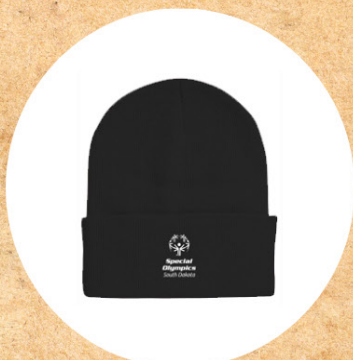
$250 Stocking Hat