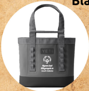
$2,000 YETI Tote