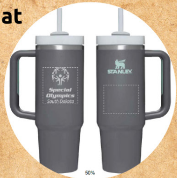
$1,000 Stanley Cup