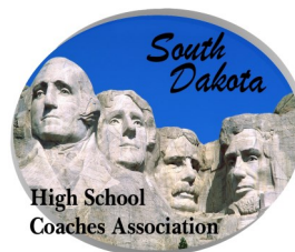
High School Coaches Association