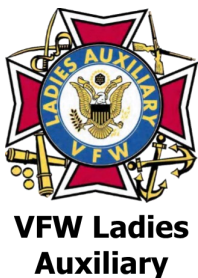
VFW Ladies Auxiliary