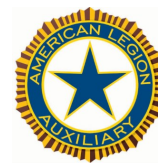
American Legion Auxiliary