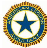
American Legion Auxiliary