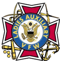
VFW Ladies Auxiliary