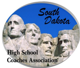
High School Coaches Association